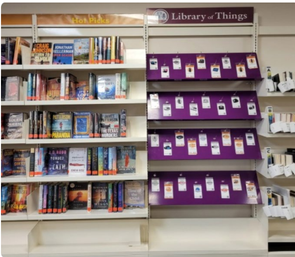
Cook Park Library (near Welcome Desk)